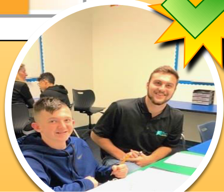
Fewer Students per Class

The Rotational Approach to Learning ® has withstood the test of time. Our One-to-One Instruction ™ with social distancing is the finest tutoring system for your child. Don't settle for small group, classroom, or online tutoring. Get your children learning again at The Tutoring Center ®